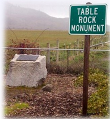
Dedicated by Crater Lake Chapter in 1928.